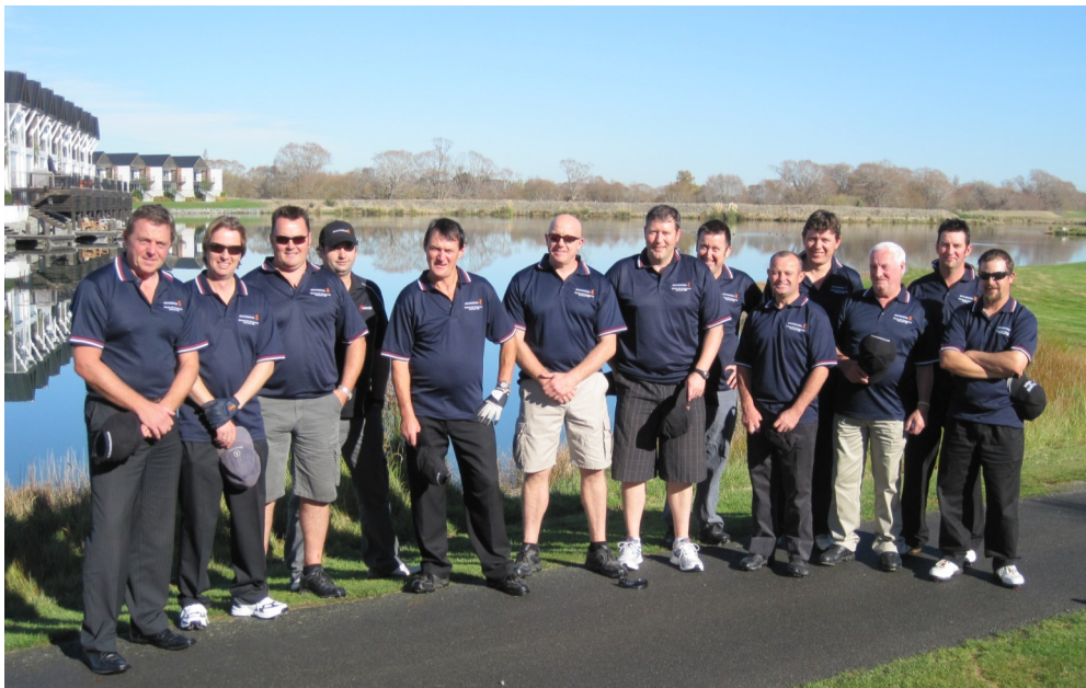
Representatives from each of the regions in the National Golf Tournament ready to tee off